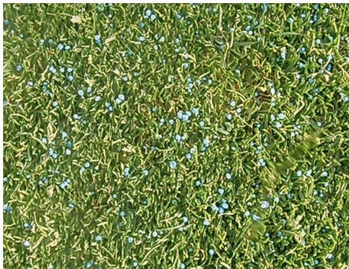
Granule distribution – EasyGreen Mini grade

Conventional grade; 20 g/m 2 = 125 granules